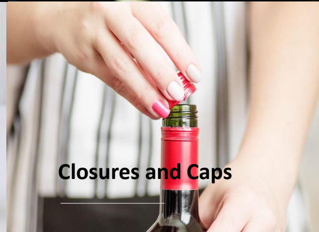
Closures and Caps