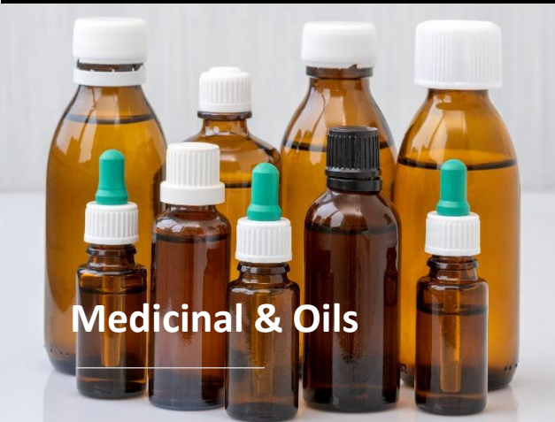
Medicinal & Oils